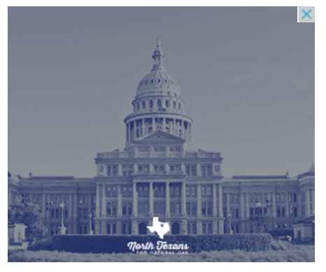
Southern Methodist University scientists conducted a study and concluded that brine production combined with wastewater disposal represented the "most likely cause of recent seismicity near